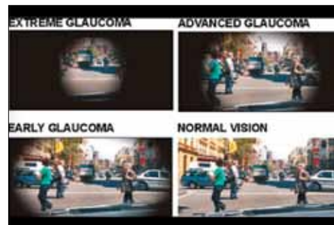
Figure 1 – Extreme glaucoma to normal vision

we utilize high magnification reading glasses or hand held magnifiers. There are also magnifiers that stand on their own for sustained reading. If the central vision is severely affected a video magnifier can achieve up to 35x magnification. Though the pace of reading is often slow, it can allow someone to read a book, do a crossword puzzle, or see a photo. For briefly spotting something at a long distance, such as a house number, we can utilize small hand held devices that operate similar to a telescope. Sustained distance activities, such as watching a concert, movie, or play, can be addressed with glasses that work like binoculars.