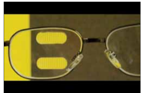
Figure 2 – Special prism lens

It is challenging to improve the loss of severe peripheral vision never mind loss with low vision devices, so we often work with the Braille Institute and occupational therapists to address lifestyle modifications.